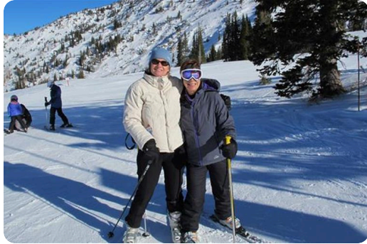
Such a loving, wonderful host!